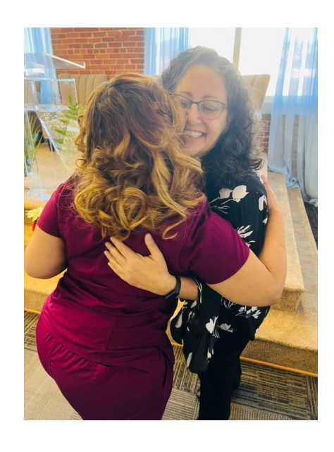
Hugs and pride of accomplishment are a big part of graduation!

Thank you for the gift of your support of our community. We wish for you the happiest of holidays, full of love. And we look to 2024, with hope.